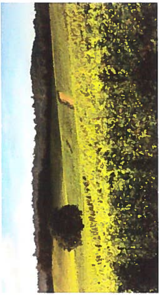
Fantastic Food Festivals - Surrey Hills Sat 15th & Sun 16th Sept 2018

Find out more and book ahead £7.50 in advance www.surreyhillsenterprises.co.uk Tickets also available from Guildford Tourist Information Centre 01483 444334 155 High Street, Guildford GU1 3AJ www.tickets.visaguildford.com