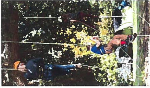
Surrey Hills Wood Fair, 6th & 7th October 10am - 5pm Fish Pond Copse near Cranleigh GU6 7DW

Explore Surrey Hills For business. for pleasure For Fantastic Festivals