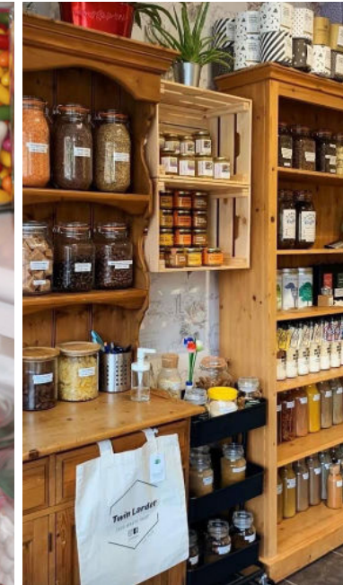
left to right: Ecobe, Shere Delights, Twin Larder