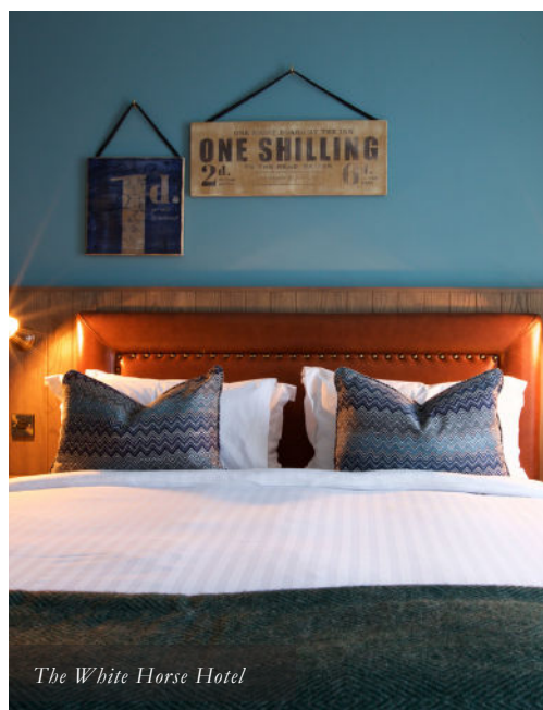
The White Horse Hotel