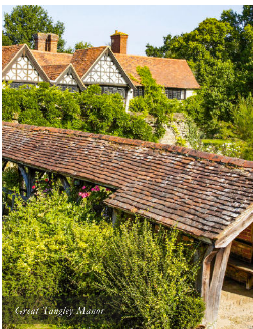
Great Tangley Manor