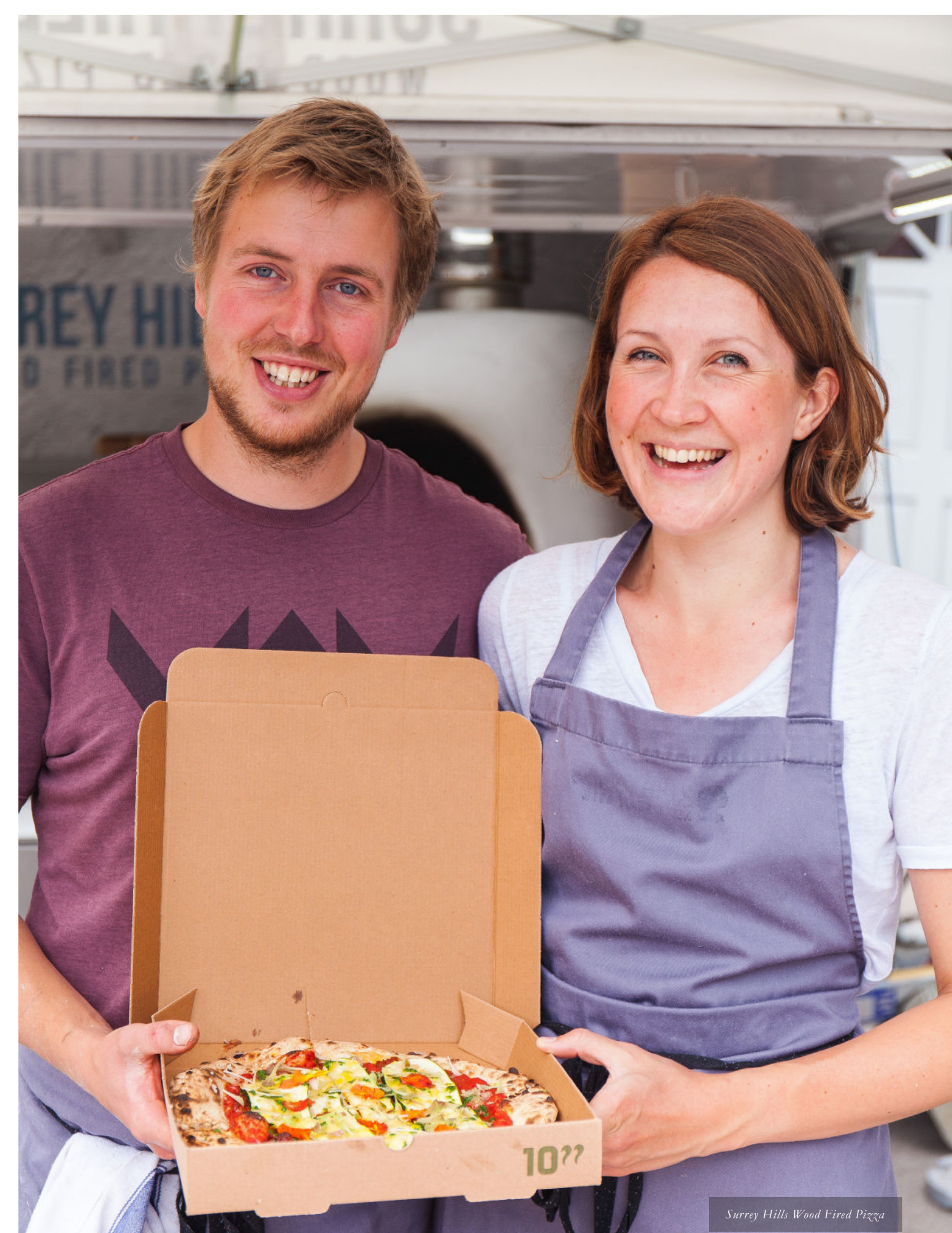
Surrey Hills Wood Fired Pizza