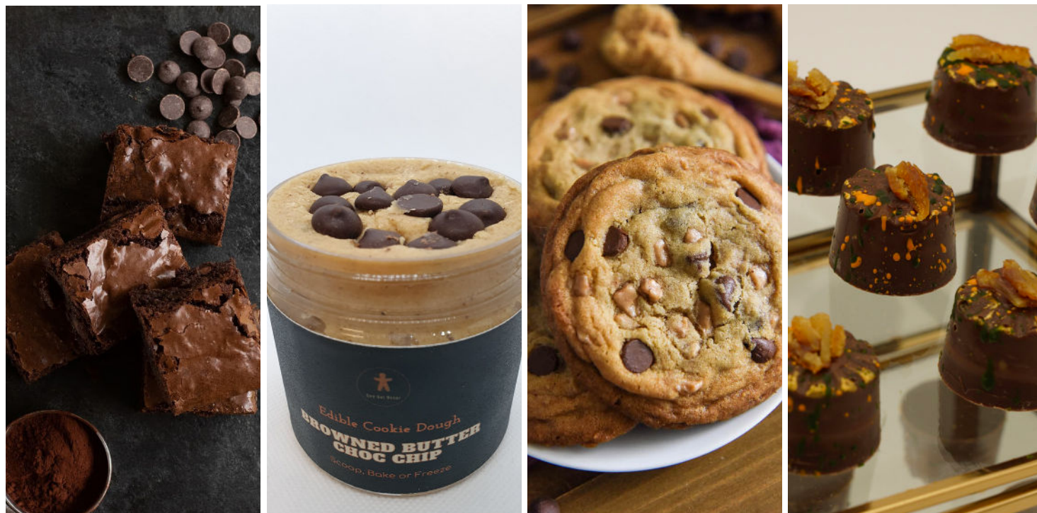
left to right: Delightfully Decadent, One Nut Baker, Hindhead Cookie Bar, Sweet C's Handcrafted Chocolates

lavendercatering.co.uk / Tel: 01372 800 626