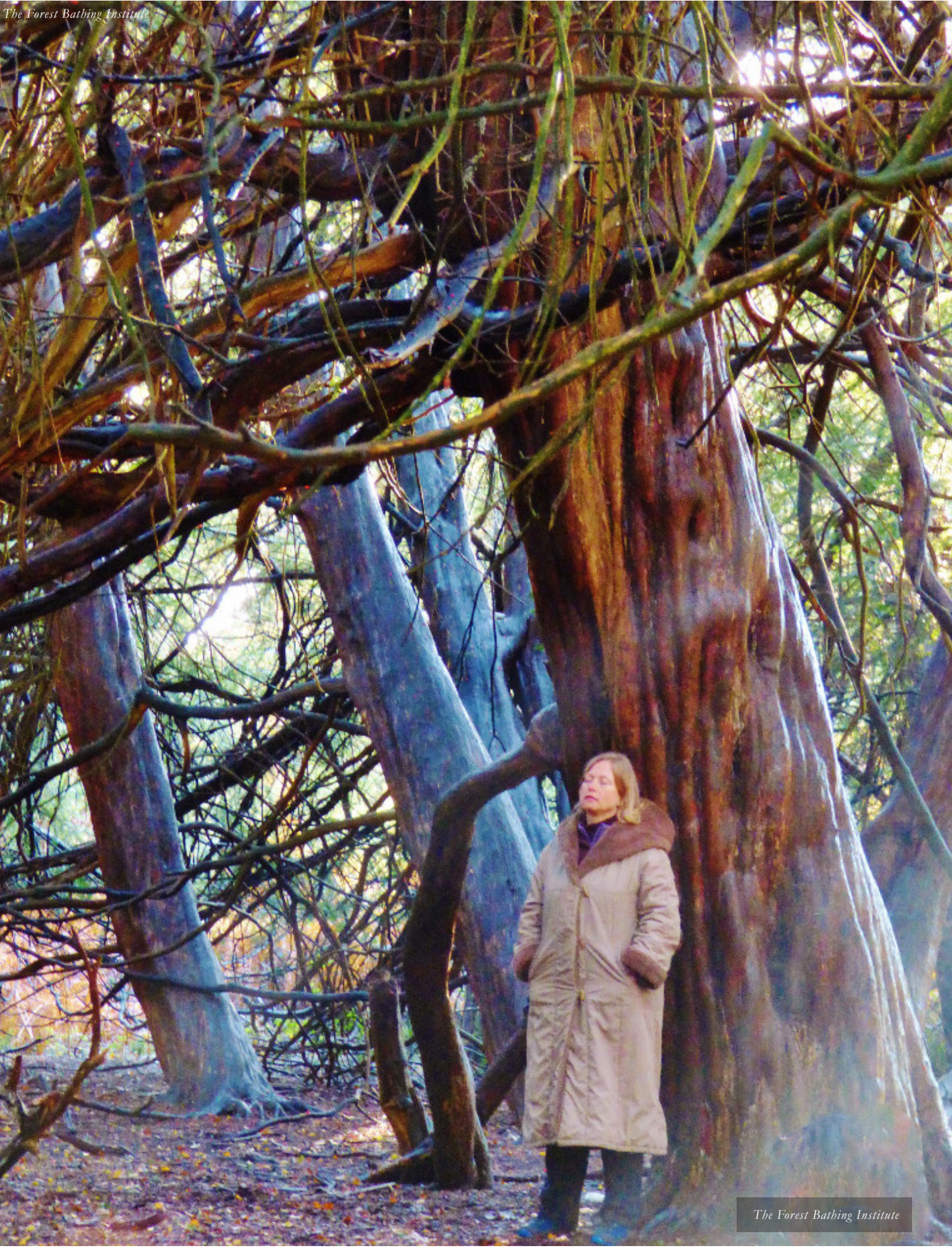
The Forest Bathing Institute