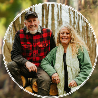
The Artisan Trail