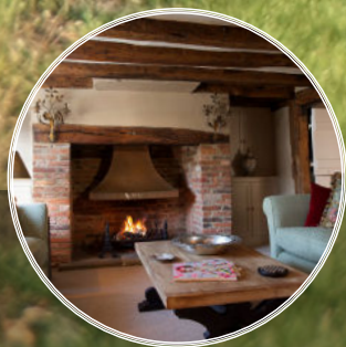
Places to Stay