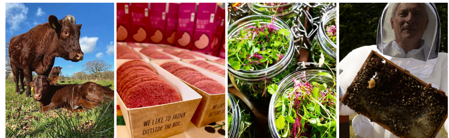
left to right: Hampton Estate, Prickly Pear Bakery, Eden Greens Urban Farm, Bee Friends Ltd