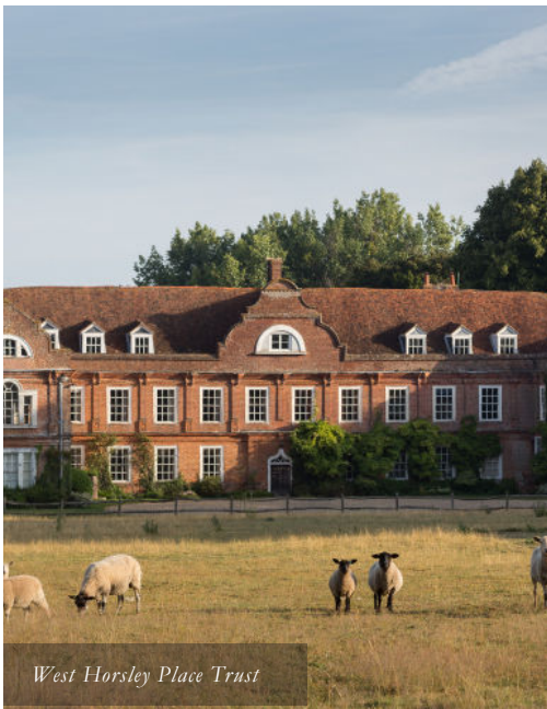
West Horsley Place Trust