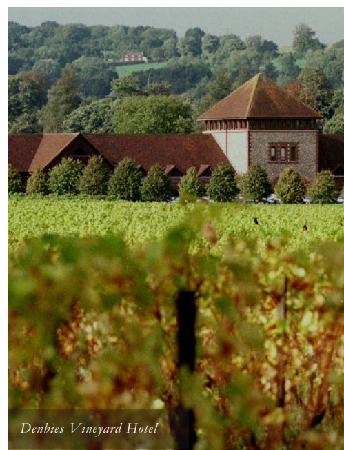
Denbies Vineyard Hotel