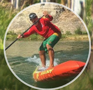
Things To Do