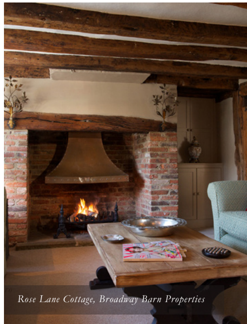
Rose Lane Cottage, Broadway Barn Properties