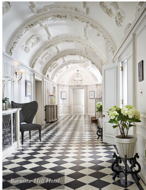
Barnett Hill Hotel