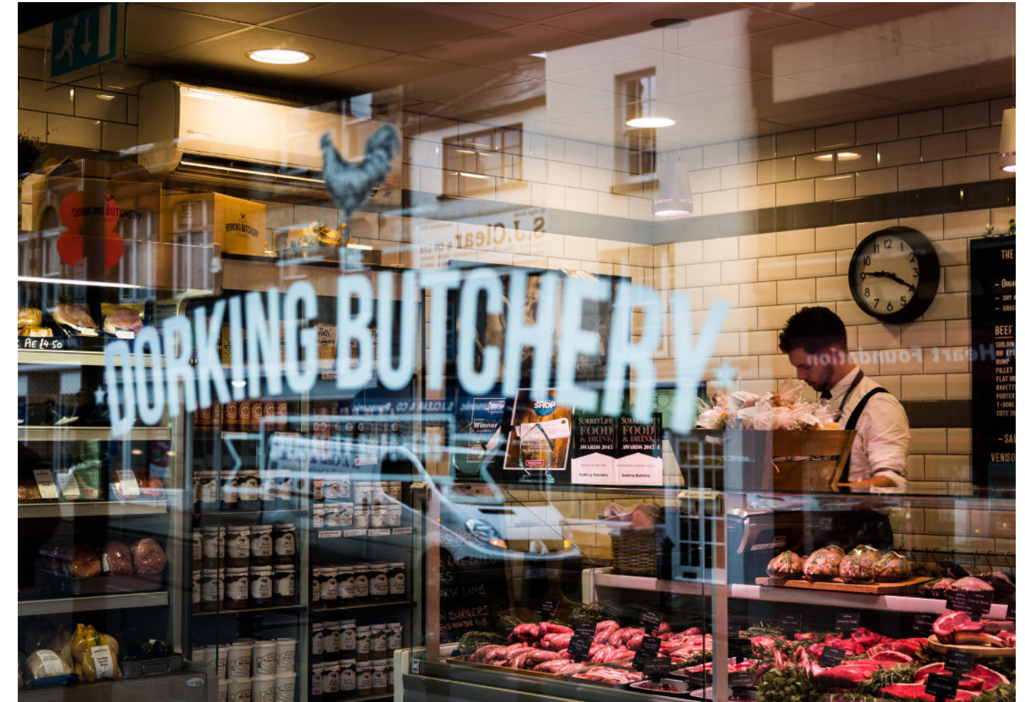
The Dorking Butchery