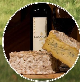
Food & Drink