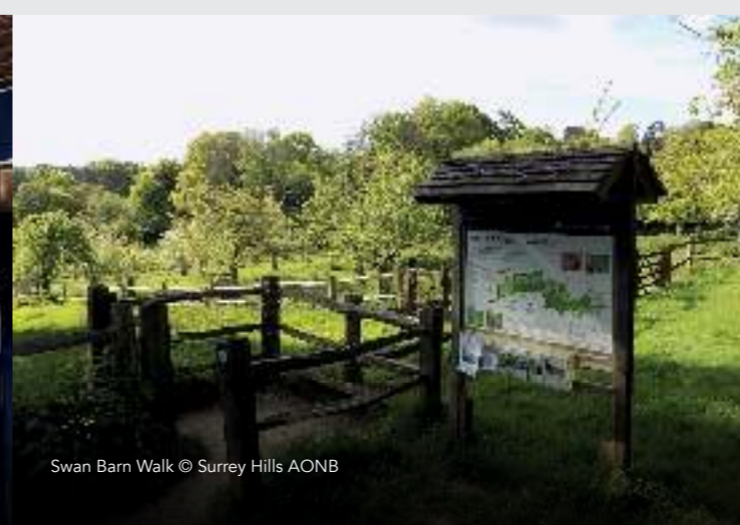
Swan Barn Walk