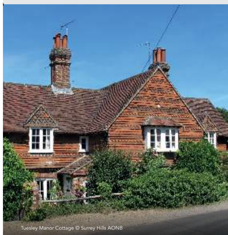
Tuesley Manor Cottage © Surrey Hills AONB

SH/The Way Design/July 2019. © Surrey Hills AONB