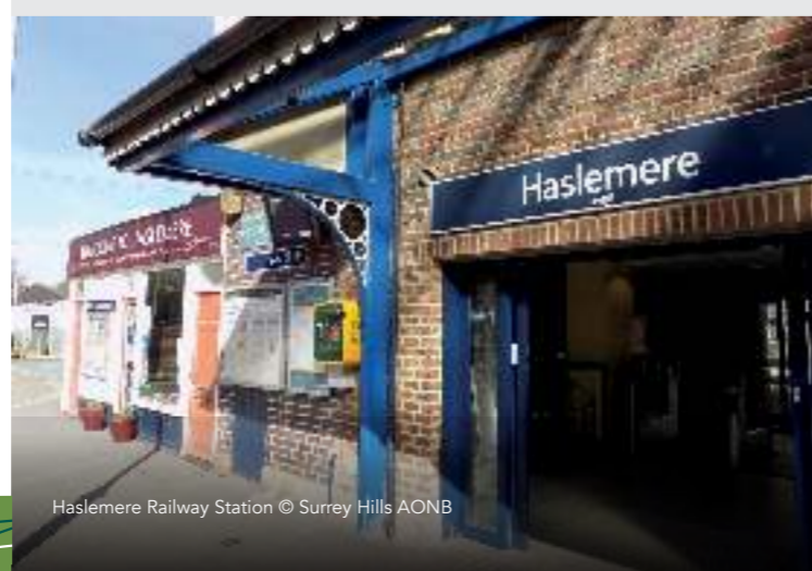
Haslemere Railway Station

For more information, take a look at surreyhillssociety.org and consider joining the Surrey Hills Society. They would love to meet you.